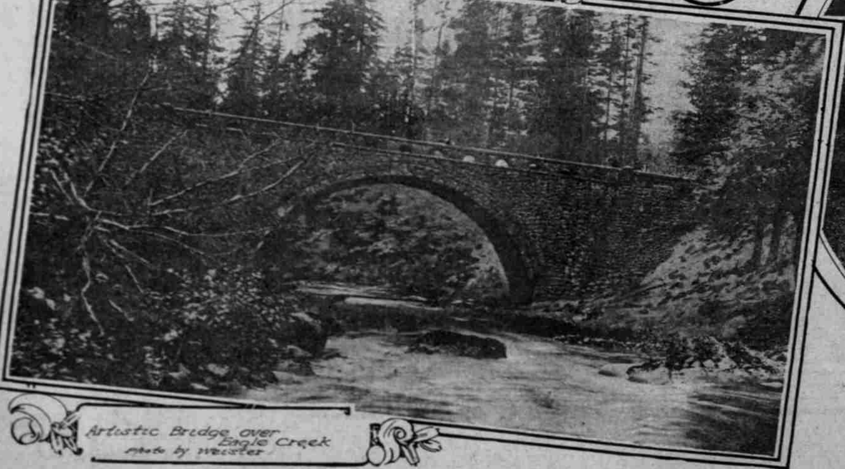
Artistic Bridge over Eagle Creek