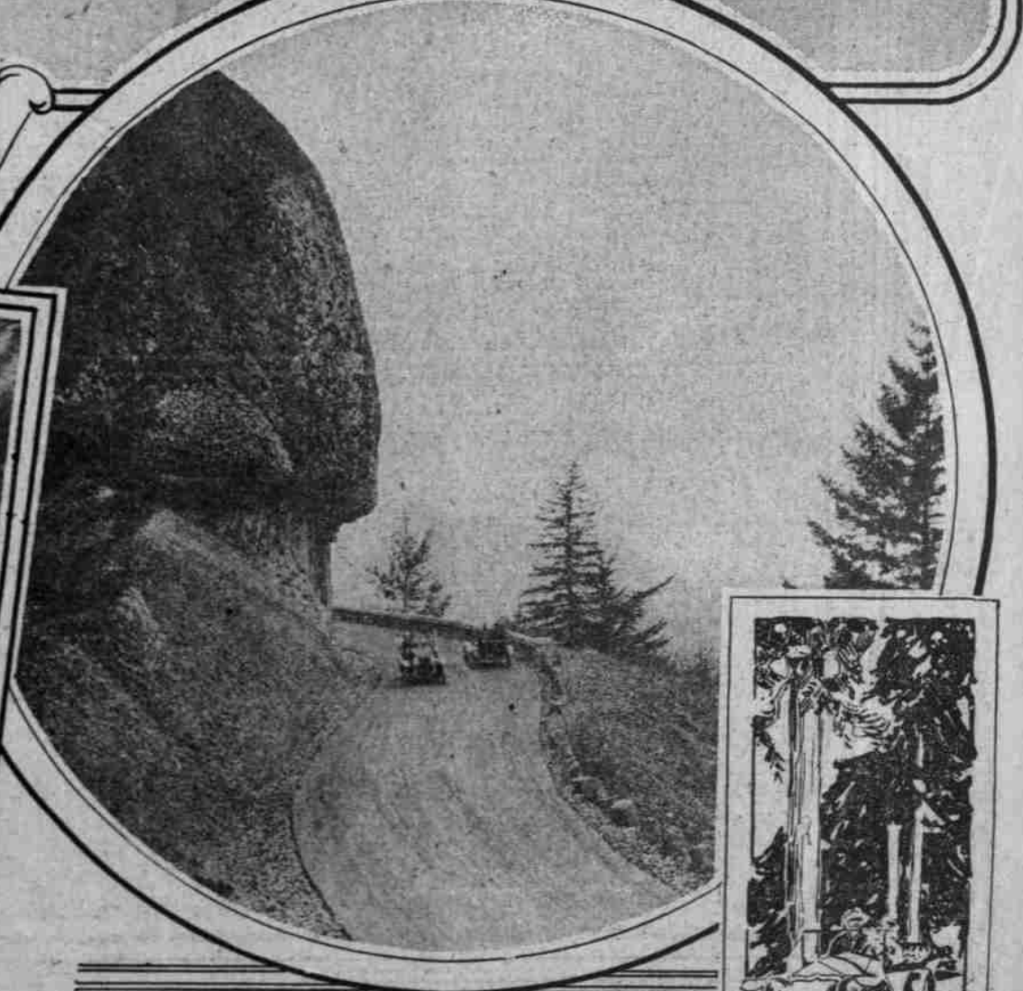
At Bishop's Cap Rock