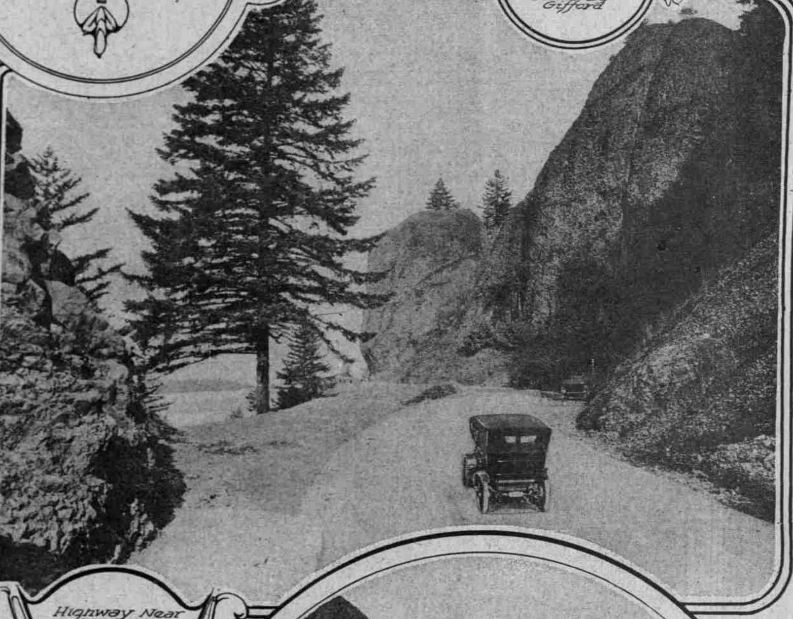
Highway Near Shepperd's Dell