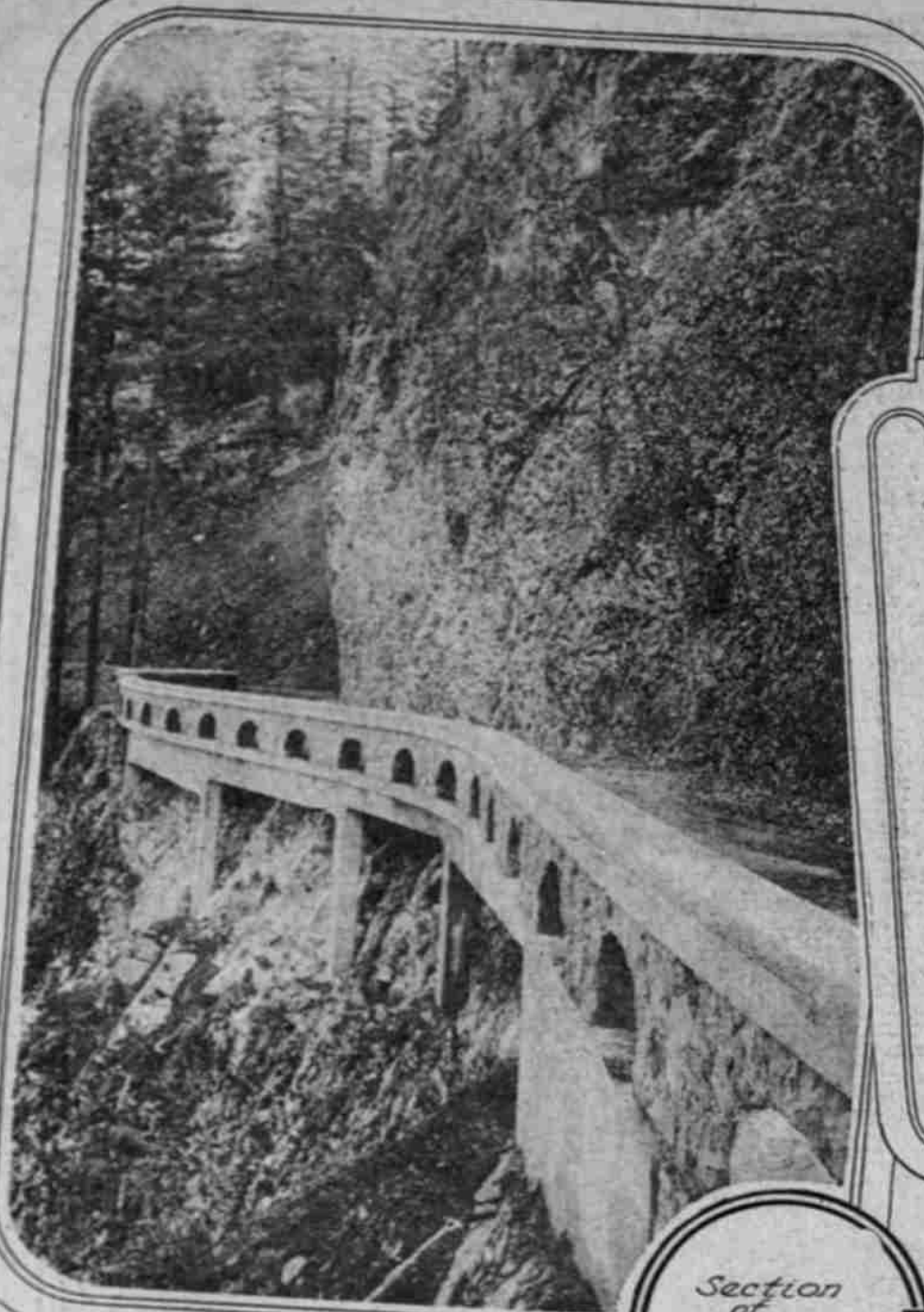
Section of Retaining Wall