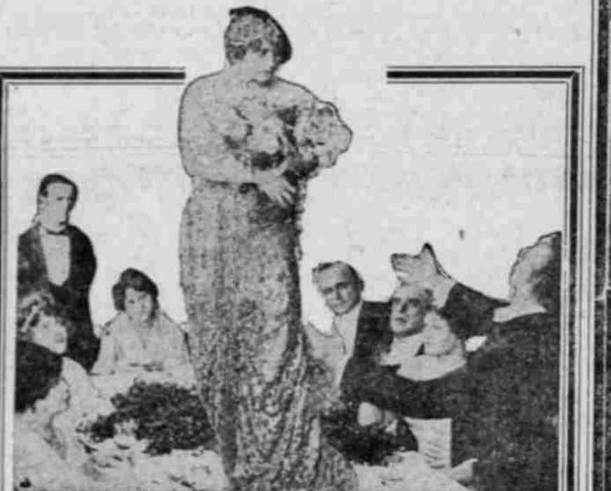
NEW YEAR'S EVE CABARET SCENE FROM