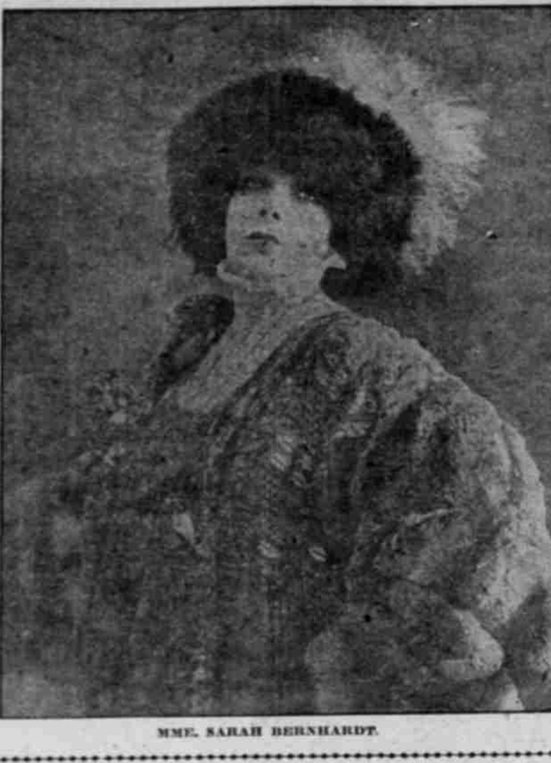
MME. SARAH BERNHARDT.