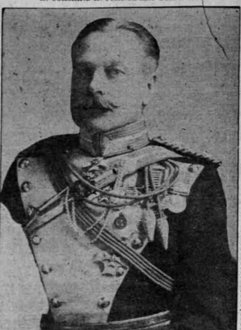
GENERAL SIR DOUGLAS HAIG.