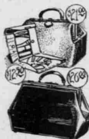
Indestructo and Hartman Luggage here exclusively.