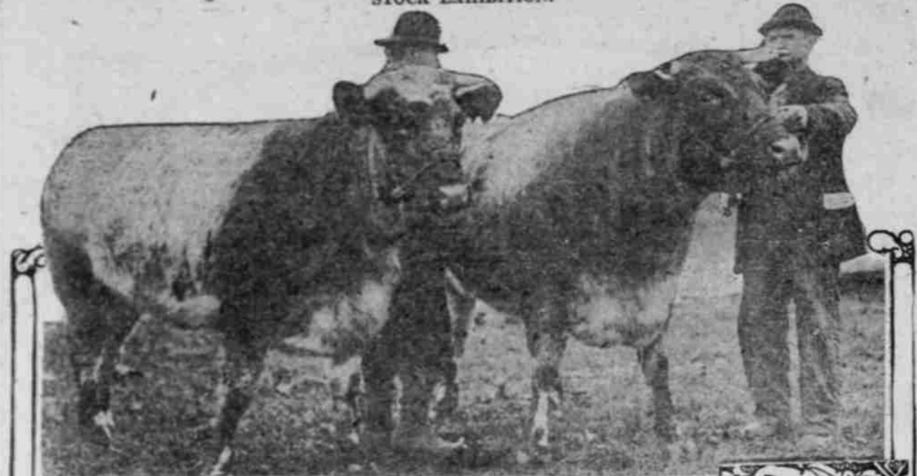
A Chalmers Prize Winning Heifer, Fort Branch Milked 10th, and Scottish Flower