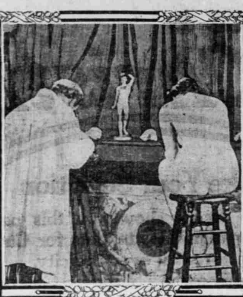
Scene from 'Inspiration' featuring Audrey Munson at the Majestic Theatre this week.

MOVING-PICTURE MEN, from manufacturer to exhibitor, point to press censorship as the ultimate outcome of what they characterize as the arbitrary and unjust method of "manhandling" motion-picture films.