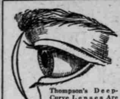
Thompson's Deep-Curve Lenses Are Better.