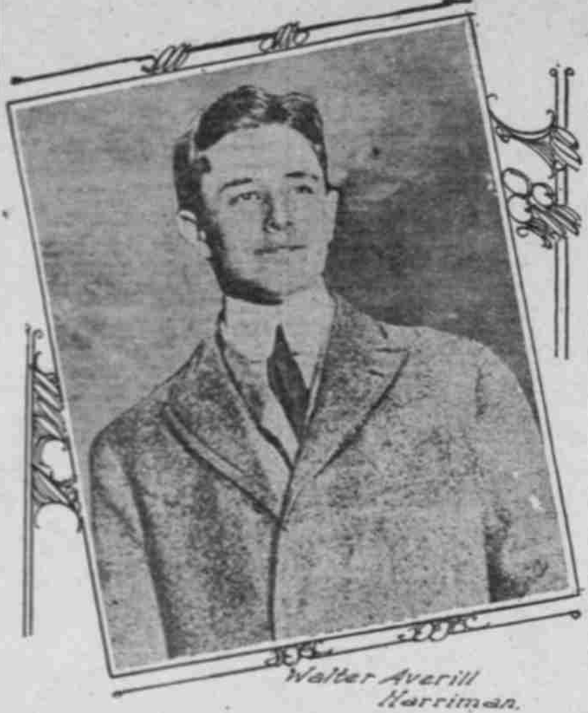
Walter Averill Harriman.