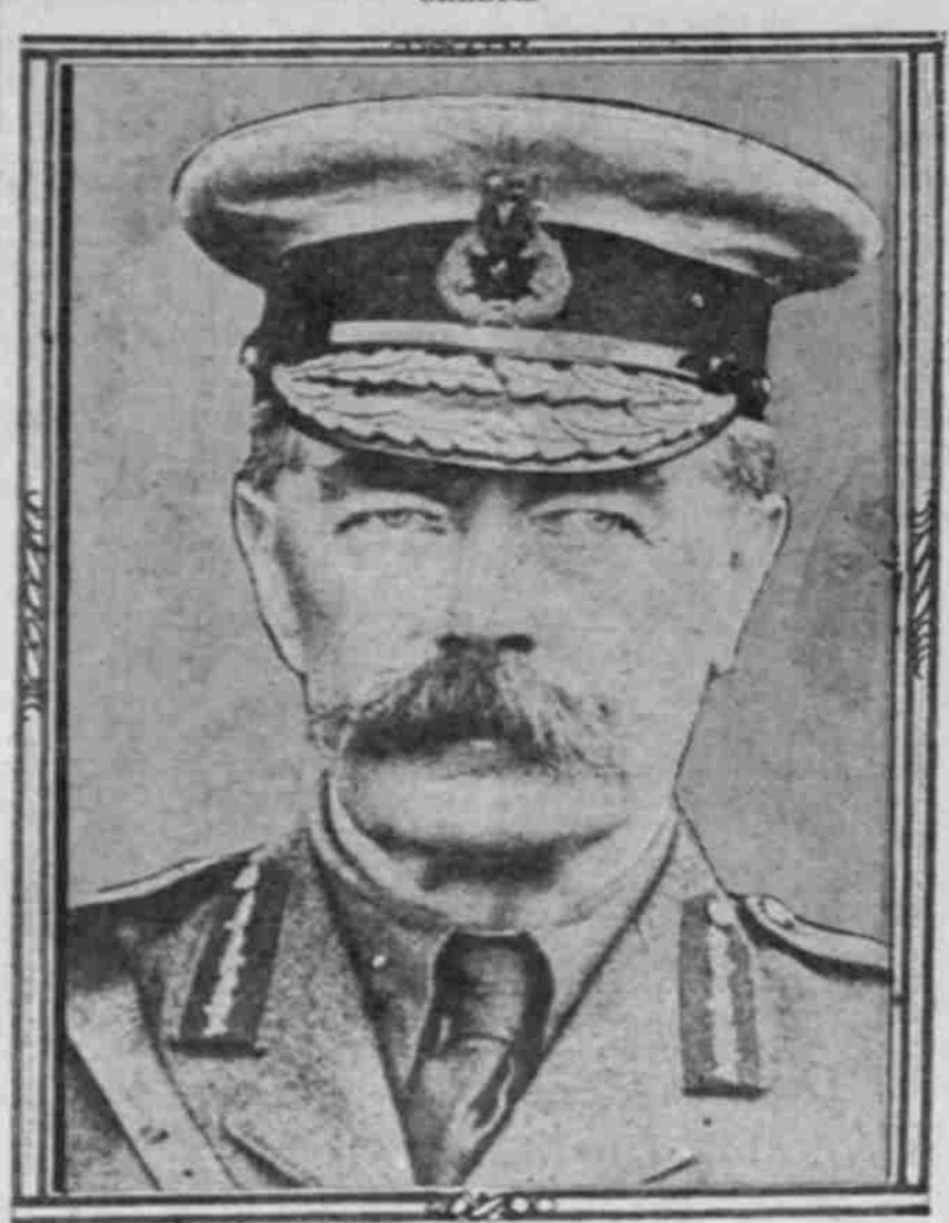
LORD KITCHENER.—Photograph by Underwood.