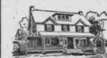
A No. 1-25-W IDEAL Boiler and 575 ft. of 3/8-in. AMERICAN Radiators, costing the owner $230, were used to heat this cottage. At this price the goods can be bought of any reputable, competent fitter. It did not include cost of labor, pipes, valves, freight, etc., which vary according to climatic and other conditions.

pleasing designs for use in any oddly shaped out-of-the-way spaces, under windows, in corners, in curved bays—wide, narrow, tall, low—and are put in as easily in old buildings as in new ones. They do away with the need of inner-doors, mantels and extra chimneys—a saving that more than offsets first cost of the outfit. Cottages, residences, stores, churches, schools, hotels, etc., whether in the city or country, with or without water main connections, are economically and evenly heated by IDEAL Boilers and AMERICAN Radiators. They never rust or wear out. Any banker or real estate man will tell you that they are an investment, increasing the permanent property value and securing 10% to 15% greater rental.