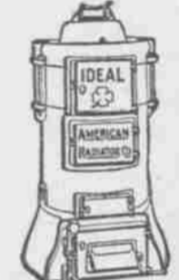
IDEAL Boilers will supply ample heat on one-chimney of fuel for 8 to 24 hours, depending on severity of weather. Every ounce of fuel is made to yield utmost results.

Their annual fuel saving feature is a big item, too. Your coal bill is materially reduced by the great efficiency of IDEAL-AMERICAN heating. All local fuels can be used and the cheapest coals are made to deliver all the heat to you in clean, uniform, healthful warmth and comfort throughout your home. Tell your architect that you want IDEAL Boilers and AMERICAN Radiators for your new building and if you are adding to or remodeling your present building see that the heating contractor gives you his estimate based upon these successful, guaranteed goods—which have stood the test of time and hard service in a million homes and buildings all over the world. Our large manufacturing volume and facilities enable us to produce IDEAL Boilers and AMERICAN Radiators at lowest costs and still maintain in them the highest standards of material, workmanship and features. Iron prices are now most attractive and at this season you get the service of the most skilled fitters. Send for free copy of our book "Ideal Heating" which covers the subject thoroughly, giving you valuable facts you should know. Write for it today.