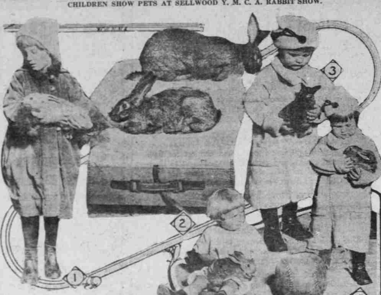
(1) Little Girl With Her Beloved Bunny. (2) First Prize Winner, Flemish Giant Rabbits. (3 and 4) Toys Holding Their Little Friends to Be Snapped by Camera.

Here is a fine old-fashioned recipe for coughs, colds or catarrh trouble that has been used for many years with great success.