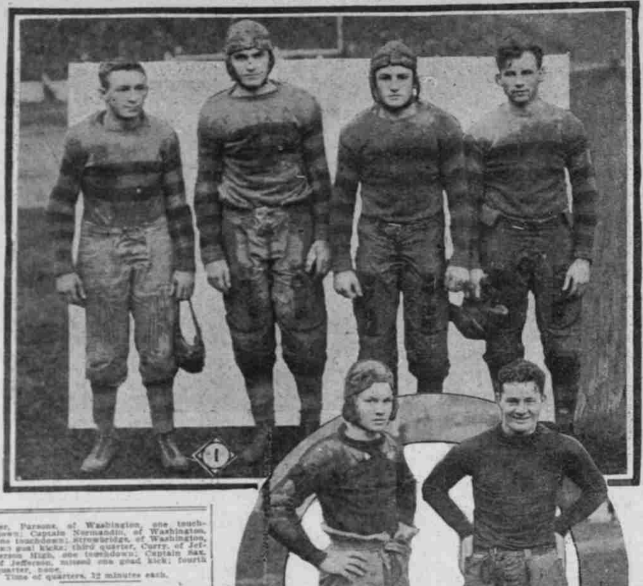
Big Leaguers Here Today. Game Between Two Touring Teams to Be Played if Weather Permits.

If weather conditions permit the game between the National and American League All-Star baseball teams will be on tap this afternoon at 2:30 o'clock at Twenty-fourth and Vaughn streets.