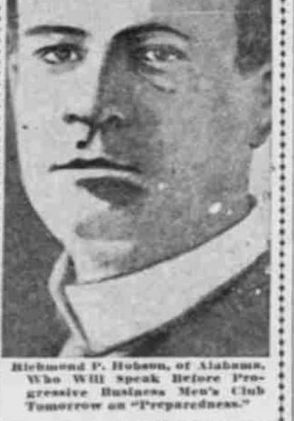
Richardson P. Hobson, of Alabama, who will speak before Progressive Business Men's Club tomorrow on "Preparedness."

OREGON EXECUTIVE HEARD Officers Elected and Letter Read From Senator Borah Pledges Support to National Prohibition Without Any Equivocation.