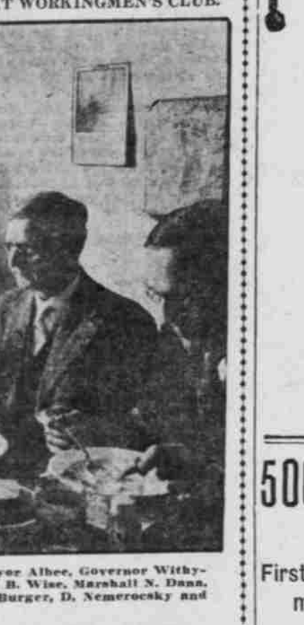
Officials of City and State Enjoy Meal with Down-and-Outs at Workingmen's Club.