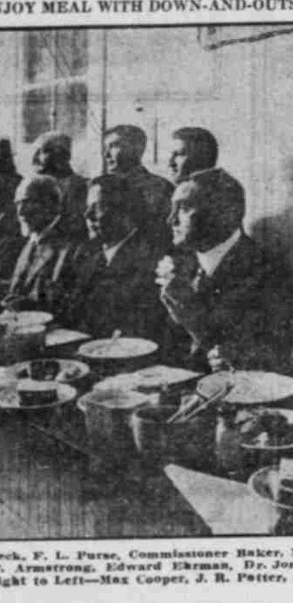
Officials of City and State Enjoy Meal with Down-and-Outs at Workingmen's Club.

Oregon Agricultural College, Corvallis, Or., Nov. 16.—(Special.)—The second annual horticultural show