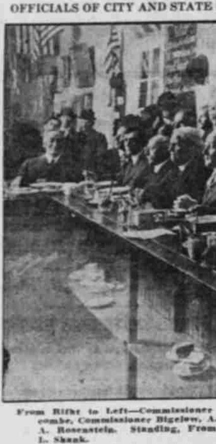
Officials of City and State Enjoy Meal with Down-and-Outs at Workingmen's Club.

Oregon Agricultural College, Corvallis, Or., Nov. 16.—(Special.)—The second annual horticultural show