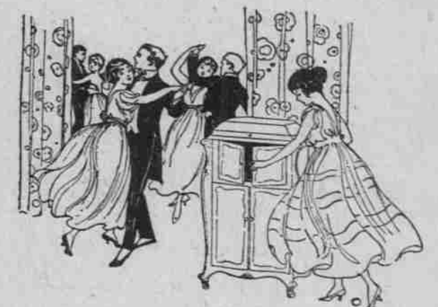
THE COVERALL, $25.00

New Easy Terms on Victrolas —How about your home these Winter evenings—will there be music and gay songs in it? The Victrola brings all the world's masters and masterpieces into your home. —Buy a Victrola outfit today on easy terms. The largest stock in Portland to select from! Victrola IV—10 selections, $19.75 Down. Per Week. Victrola VI—12 selections, $29.50 $ 50 Victrola IX—18 selections, $58.25 $ 1.00 Victrola X—24 selections, $87.00 $ 1.50 Basement Balcony.