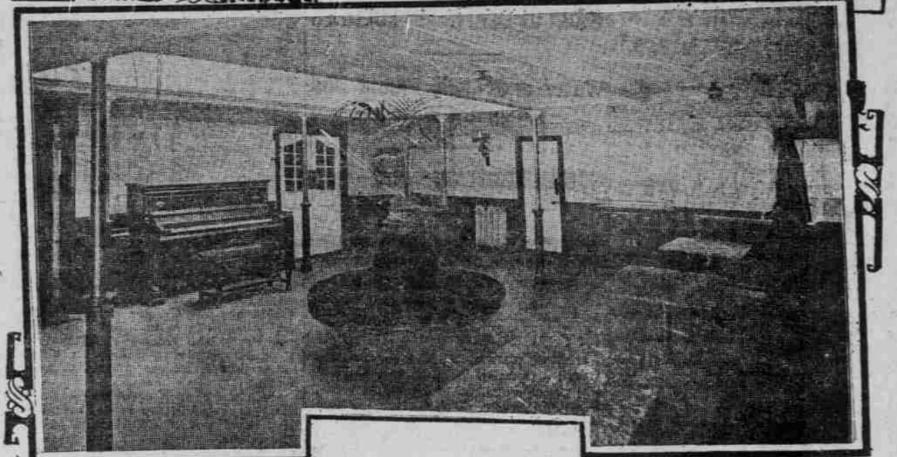
Steamer Ancona and Scene in Her Social Palace.