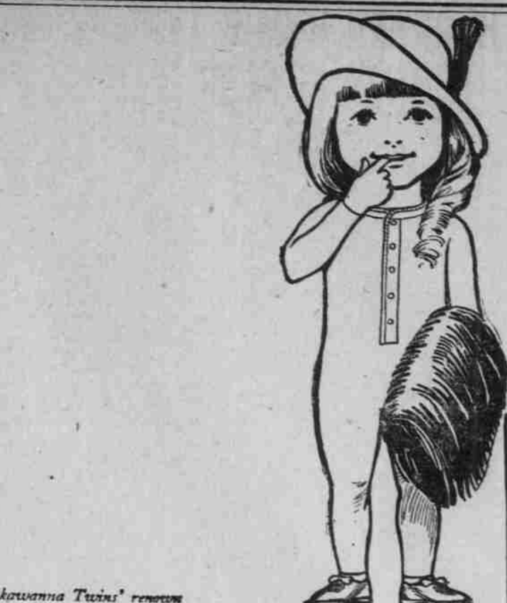
The Lackawanna Twins' renown is spreading fast in every town. Because they stand for garments "rare"—Yes, Lackawanna Underwear.

THE non-shrinkable qualities of an undergarment are of the utmost importance. Underwear which washes poorly and shrinks all out of shape is dear at any price.