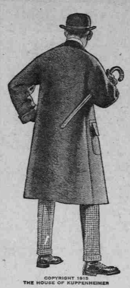
Copyright 1915 THE HOUSE OF KUPPENHEIMER

This is a store of service. Conveniently arranged on one floor, so you may quickly find any department and secure prompt, courteous and efficient service at any hour of the day.