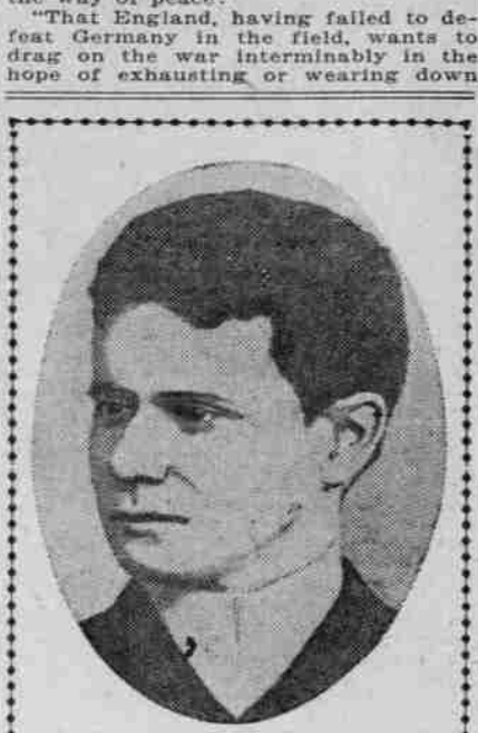
Maximilian Harden, Noted German Editor, Who Says Britain's Attitude is Delaying Peace in Europe.

fiend and the Mephistopheles of this war." "Neither do I," declared Harden. "I do not know him personally, but I have talked with numerous diplomats, both German and others, who do know him well, and they have always characterized him to me as a man of high ideals and peace-loving nature. I would consider Grey's retirement as the worst possible blow to any hopes for peace within the next six months. If Grey resigns, I believe it will be less because he may be considered responsible for the failure of England's foreign policy, especially in the Balkans, than because, being a man of sense and reason, he does not want to participate in the policy of those who are attacking him, and bringing pressure on him. I am inclined to think that he sees the utter uselessness of letting Europe bleed itself to death, as it is doing."