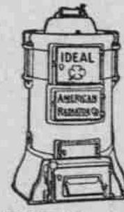
IDEAL Boilers have large fuel pots in which the air and coal gases thoroughly mix as in a modern gas or oil burner, thus extracting every bit of the heat from the fuel. Easier to run than a stove.

Another great labor-saver—stationary Vacuum Cleaner, at $150. You can wonderfully reduce house-labor and highly increase home health and cleanliness by use of ARCO Wand Vacuum Cleaner—sits in basement or side room; works through an iron pipe running to all floors; carries all dirt, dust, insects and their eggs, etc., to sealed bucket in machine; cleans carpets, furnishings, walls, ceilings, clothing. Ask also for catalog (free). Inquiry puts you under no obligation to buy.