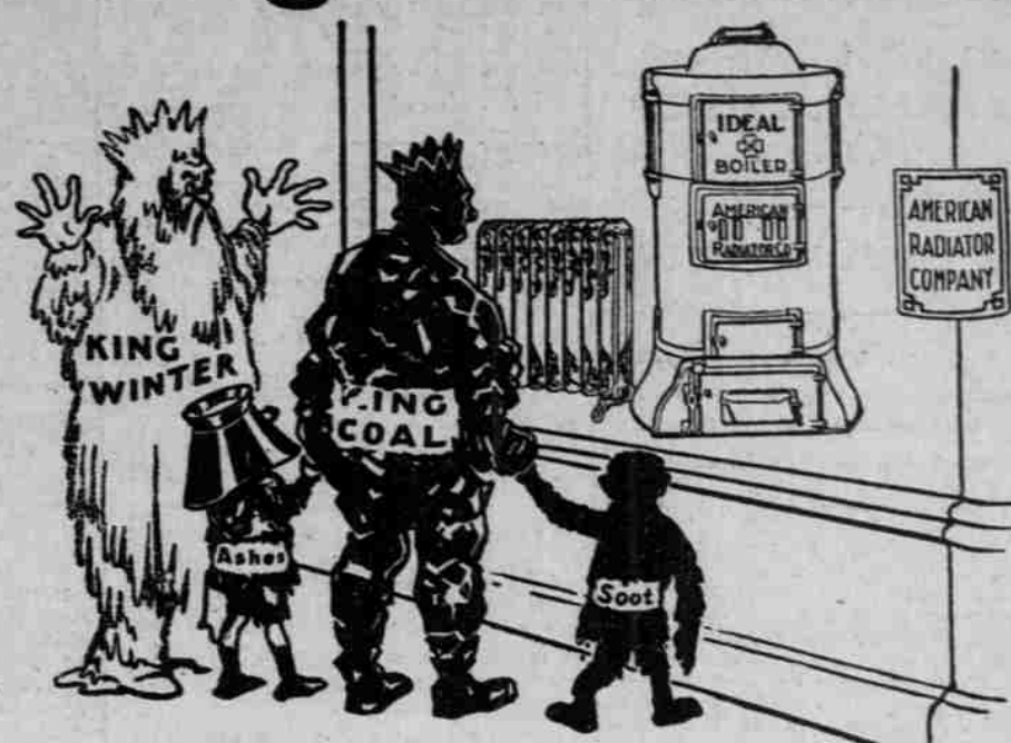
Ideal heating bars out the tyrants of cold!

Old enemies of mankind, like King Winter and King Coal, with their troublesome broods that have made war on housewives for many centuries, are fast surrendering to modern scientific methods. Due to the proved, wonderful merits of ideal heating, we are enjoying larger sales than ever before, despite general business conditions and lessened building operations. We deliver genuine comfort and a big-paying investment in every outfit of