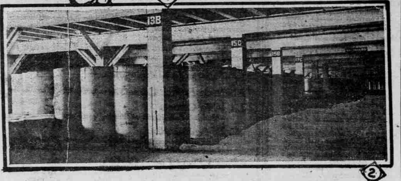
PART OF 2000-TON ORDER FILED IN MUNICIPAL DOCK NO. 2.