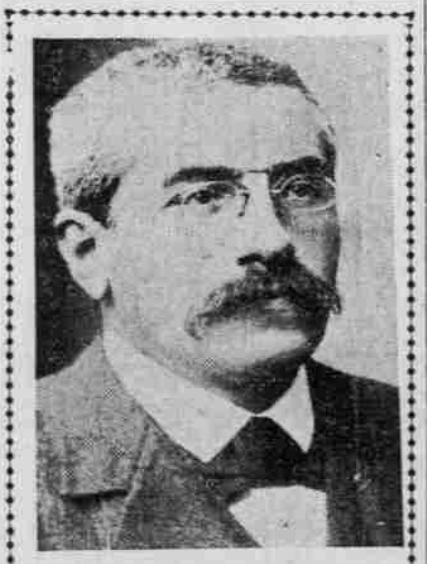
Theophile Delcasse, Foreign Minister of France, Whose Resignation From Cabinet Was Accepted Yesterday.

NEW YORK, Oct. 12.—The trial of the directors and former directors of the New York, New Haven & Hartford Railroad, which will test the ability of the government to obtain the conviction of the directors of an alleged monopolistic corporation under the so-called criminal clause of the Sherman anti-trust law, was begun in the Federal Court here today before Judge Hunt. Three tentative jurors were in the box at adjournment tonight.