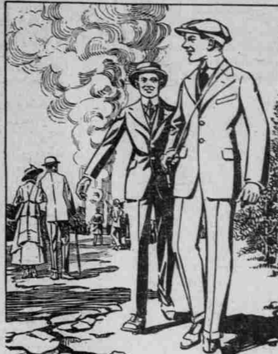
Society Brand Clothes