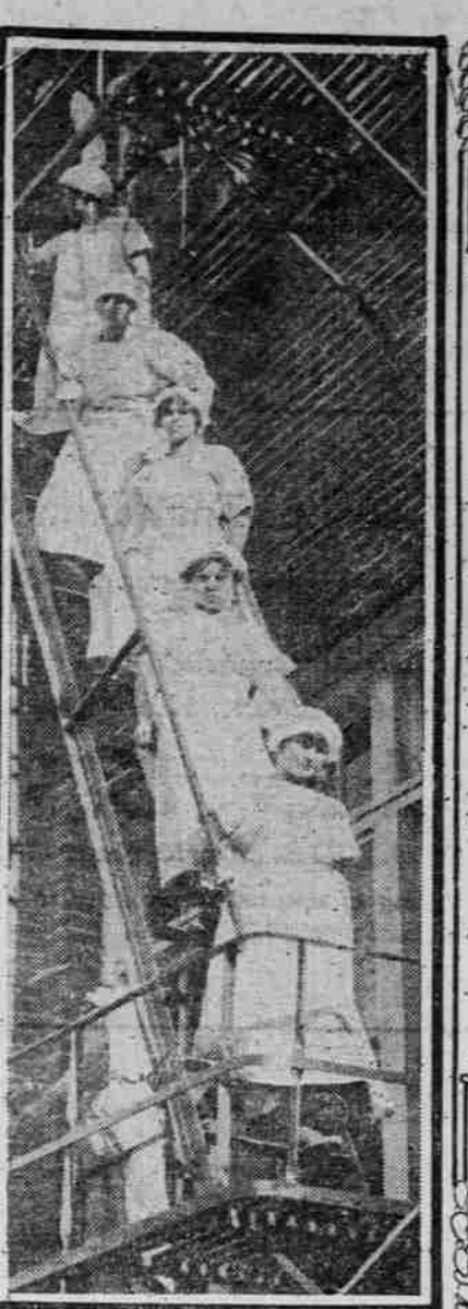
Left—Girls at Albers Bros. Milling Company's Plant Taking the Fire Escape in Lightning Fashion. Right—Employees of Fire Escapes in Drill.