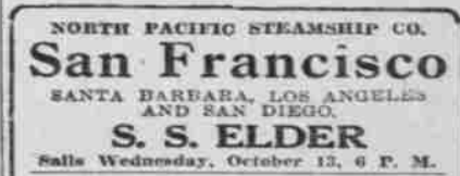
S. S. ELDER Sails Wednesday, October 13, 6 P. M.