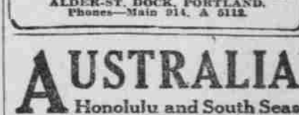
San Francisco S. S. ELDER Sails Wednesday, October 13, 6 P. M.