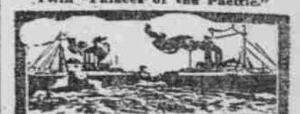
San Francisco Los Angeles (Without Change En Route).

Associated Fruit Growers OF HOOD RIVER. $5.00 PER SHARE. 303 A 113, OREGONIAN.