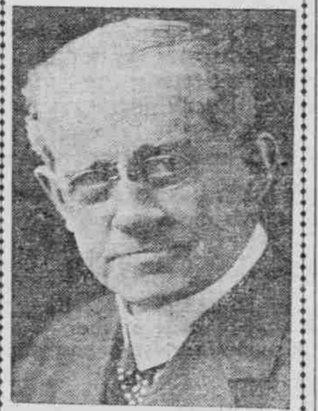
William H. Crane, Dean of American Comedians, Who Stars at the Helbig in "The New Henrietta."