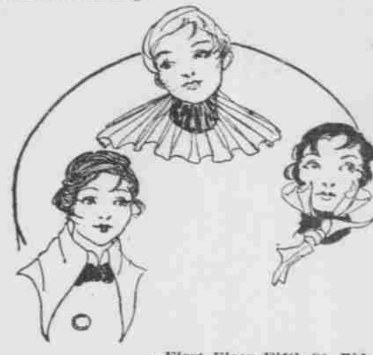
—First Floor Fifth-St. Bldg.

—Extra long messaline ties. Plain colors and fancy styles included. Stripes and plaids in the lot.