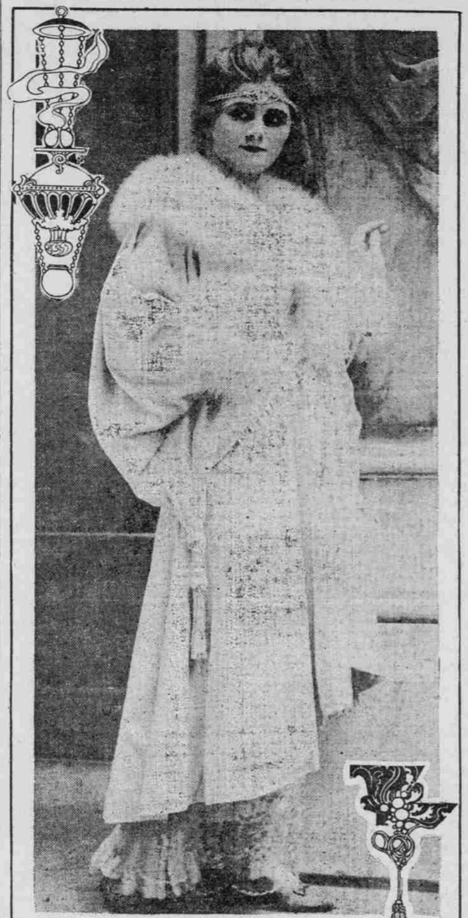
Evening Cloak For Opera Wear

This charming opera wrap was one of the most attractive models seen in the recent Fashion Show of "Made-in-America" creations held in New York.