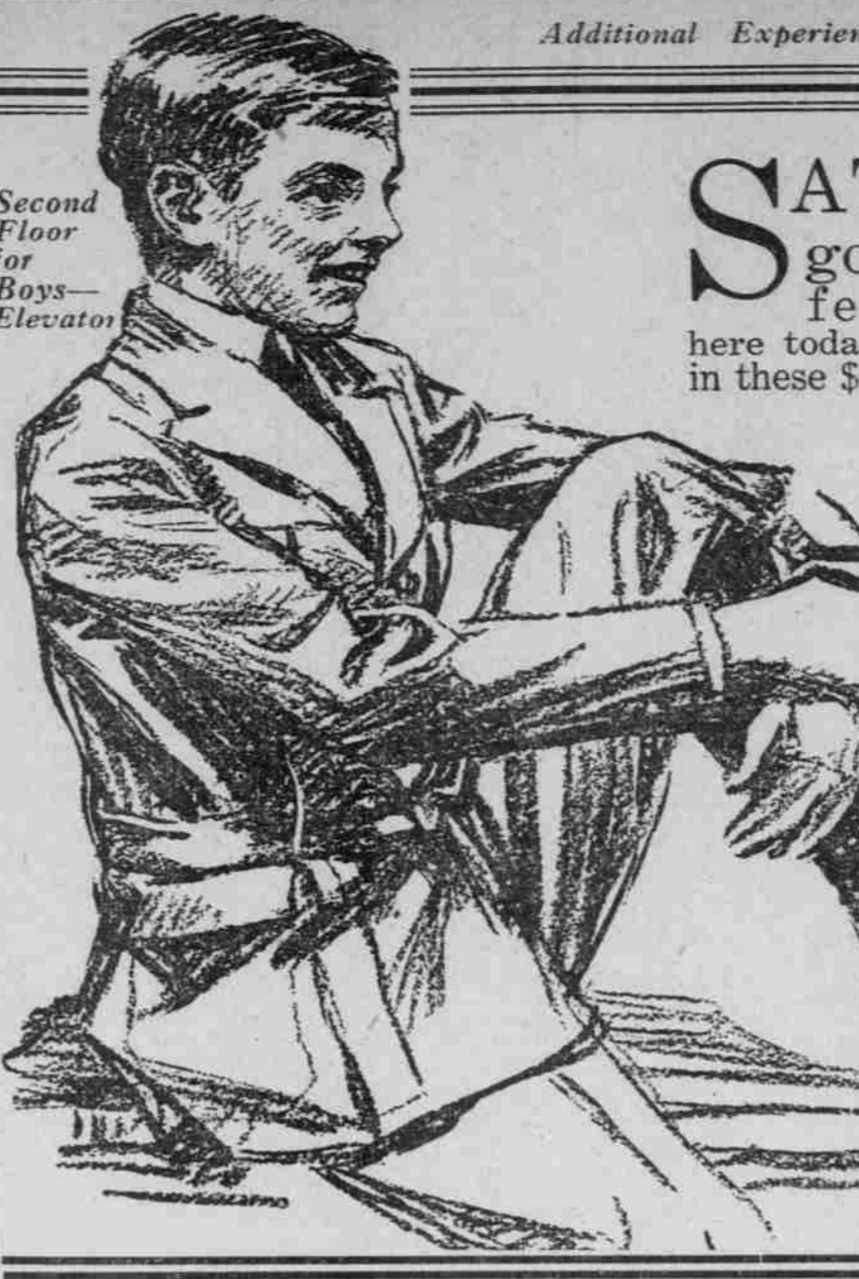
Second Floor for Boys Elevator

Senator Scores Taft. POINDEXTER REPLIES TO WELCOME GIVEN PROGRESSIVES. Ex-President Overlooks Repudiation by Republican Party, Is Answered, and Betrayal Is Also Charged.