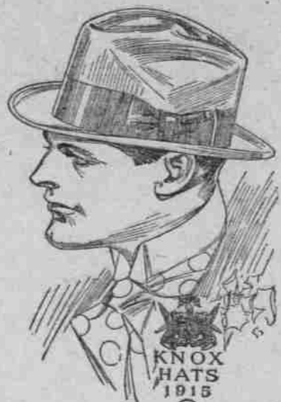
the stylish soft hat

priced $3, $4 and $5 special knox derbies $10 and $20