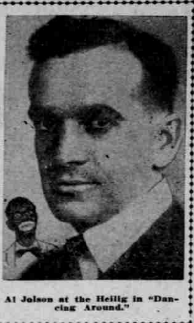
Al Jolson at the Hellig in "Dancing Around."

"You see, I can't always tell if I got 'em," he says, "serious business, this funny business stuff," he said. "Once you get 'em, they don't get away often, but lemme tell you somethin', you got to get 'em. Some peopple don't come to the theater to laugh—they come to be made to laugh and that word 'made' covers up a multitude of funny business ideas."