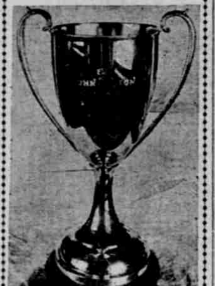
Silver Loving Cup Given by Prominent Portland Men.

Mass. several years ago. She writes to The Oregonian: