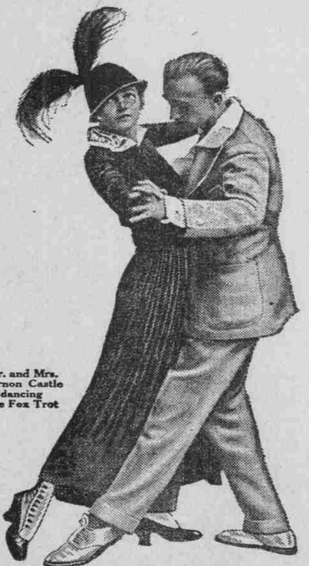
Mr. and Mrs. Vernon Castle dancing the Fox Trot

Victor Talking Machine Co. Camden, N. J.