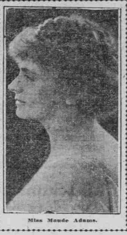
Miss Maude Adams.

OF ALL the combinations that the stage has had in recent years there has been no more successful one than that of Maude Adams, the popular actress, and James Matthew Barrie, the gifted Scotch dramatist.