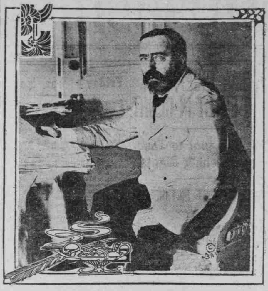
DR. BERNHARD DERNBURG.