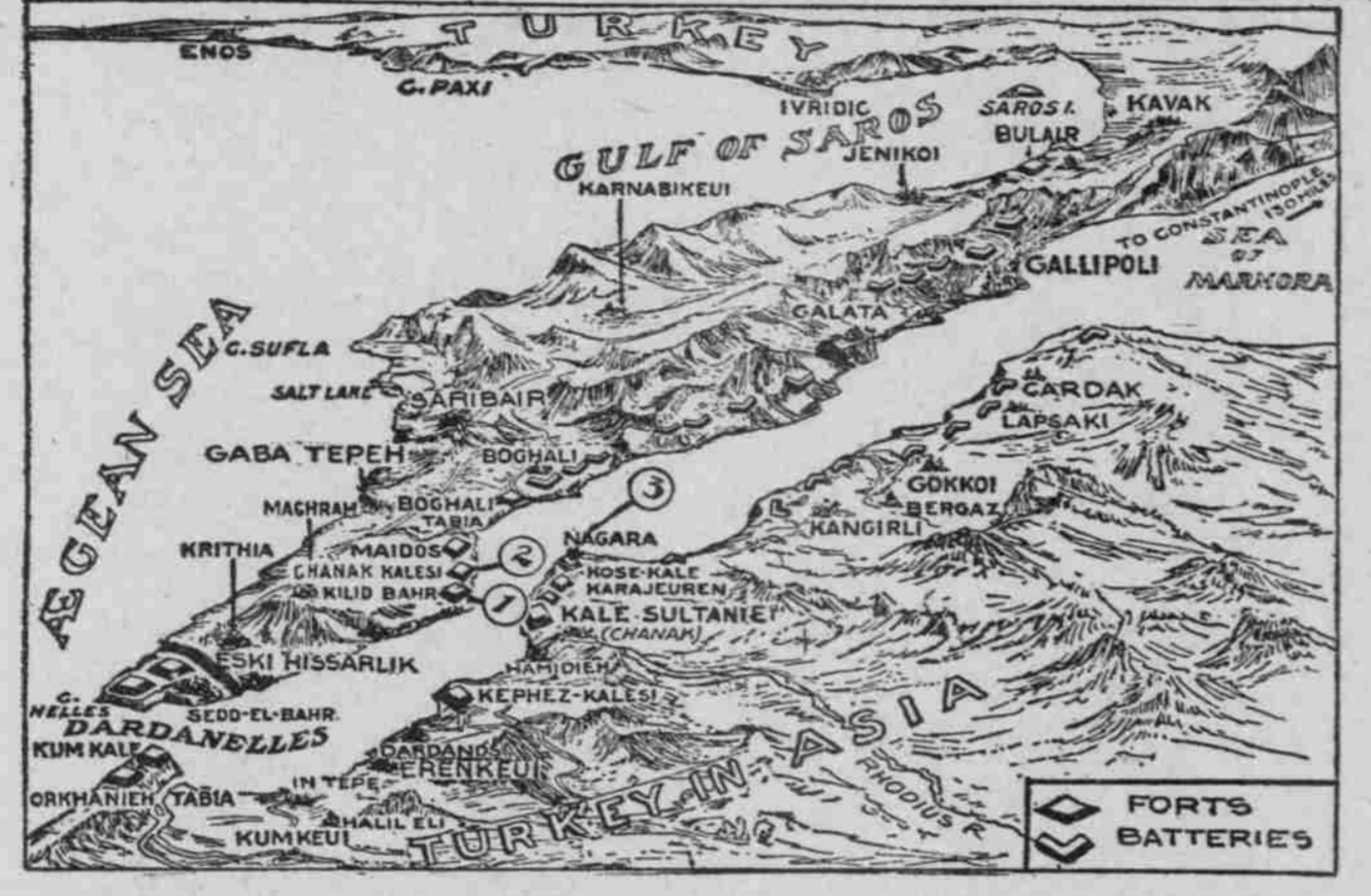
TOP—BATTLESHIP GOLIATH. BELOW—(1) KALID BAHR, (2) CHANAK K ALES, (3) NOGARA, ALL OF WHICH SUFFERED IN YESTERDAY'S SHELLING.