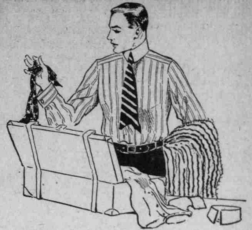
—First Floor, Just Off Washington St.

Real Armenian Lace-Edge Handkerchiefs Of a Fine Quality That Sells at 50c. 29c Offered Saturday for the First Time at