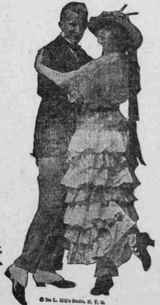
Mr. and Mrs. Vernon Castle dancing the Castle Polka

Victor Talking Machine Co. Camden, N. J.