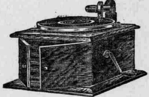
Victrola IV, $15 Oak

Store 25x75, centrally located, fireproof building, water, heat and light included in rental. If you want to change locations and secure a first-class store in the best retail center, this is your opportunity. L. 569, Oregonian.