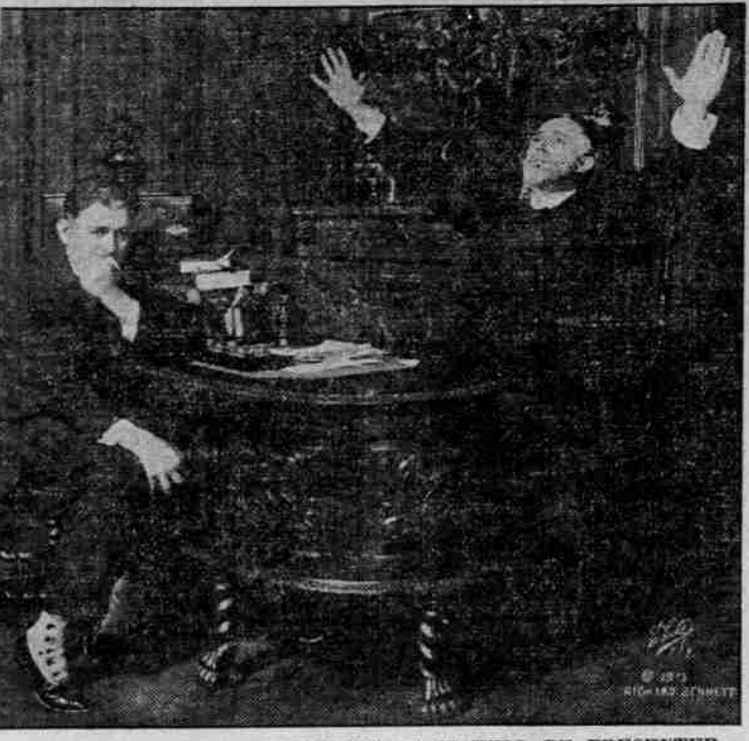
SCENE FROM "DAMAGED GOODS" AS IT WILL BE PRESENTED.