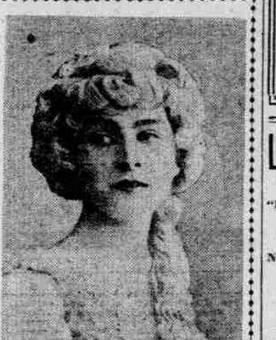
Maggie Teyte, Who Will Appear in Heilig Recital Tonight.