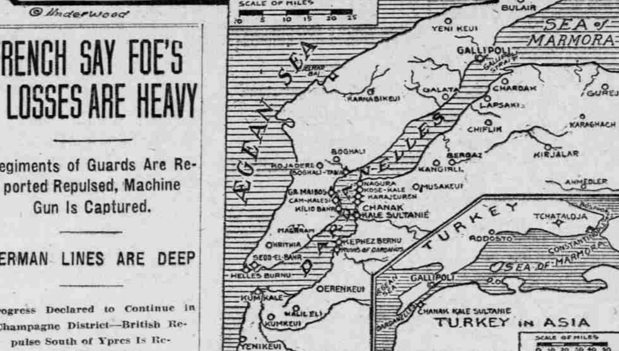
MAP AND PHOTOGRAPH OF INVADING WARSHIP.

FRENCH SAY FOE'S LOSSES ARE HEAVY Regiments of Guards Are Reported Repulsed, Machine Gun Is Captured. GERMAN LINES ARE DEEP Progress Declared to Continue in Champagne District—British Repulse South of Ypres Is Related by Berlin.