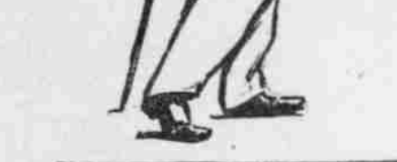
THE GOOD JUDGE APPEALS TO THE POSTMAN

SAY JUDGE—I WILL DELIVER THE REAL TOBACCO CHEW ANYTIME