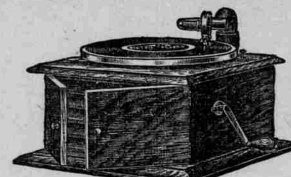
Victrola IV, $15 Oak