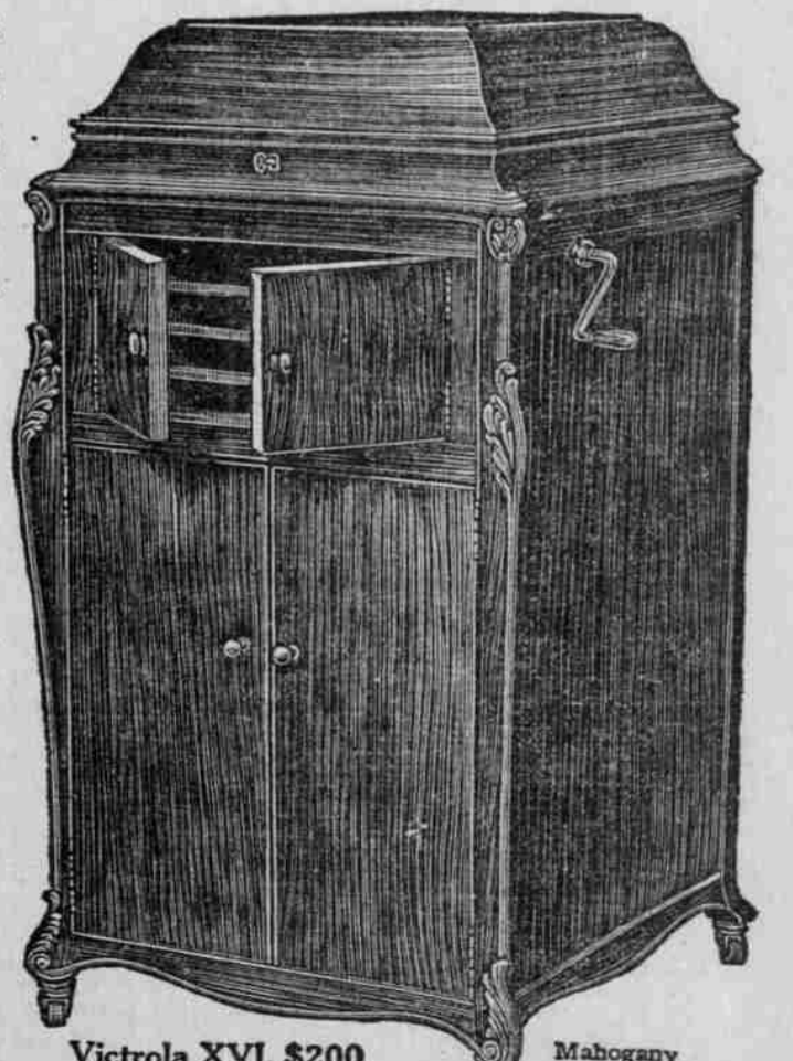
Victrola XVI, $200 Mahogany or oak. The instrument by which the value of all musical instruments is measured.

There are Victors and Victrolas in great variety of styles from $10 to $200, and any Victor dealer will gladly demonstrate them to you. Victor Talking Machine Co. Camden, N. J.