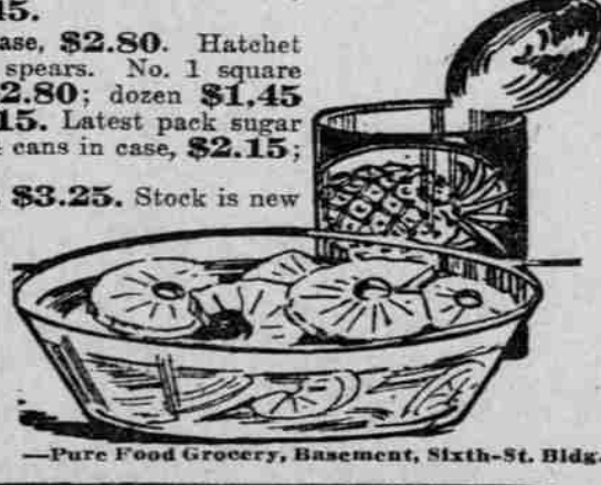
—Pure Food Grocery, Basement, Sixth-St. Bldg.

Mount Vernon Milk, Case $3.35 . The highest grade. 48 cans in case, $3.35 —dozen cans. 85c