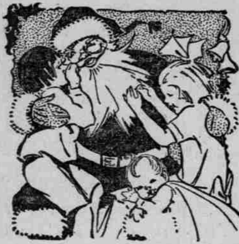
Meier & Frank's 1298th Friday Surprise Sales

To Make Gift Choosing Most Economical Today at Meier & Frank's Great Xmas Store