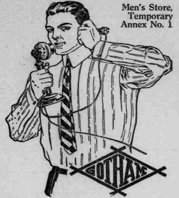
Men's Store, Temporary Annex No. 1