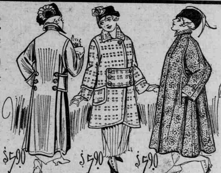
—Fourth Floor, Sixth-St. Bldg.

Coats for women, misses and juniors included in this great sale! All wool materials, tweeds, boucle, a very large assortment of fancy mixtures, plain blacks, navy, brown and fancy plaids and stripes. Greatest possible variety of styles. Coats for utility and "dressy" wear. 3 Handsome Models Are Illustrated. For Best Choice Make Early Selection Today! We Anticipate Only Few Coats Remaining for Saturday Selling