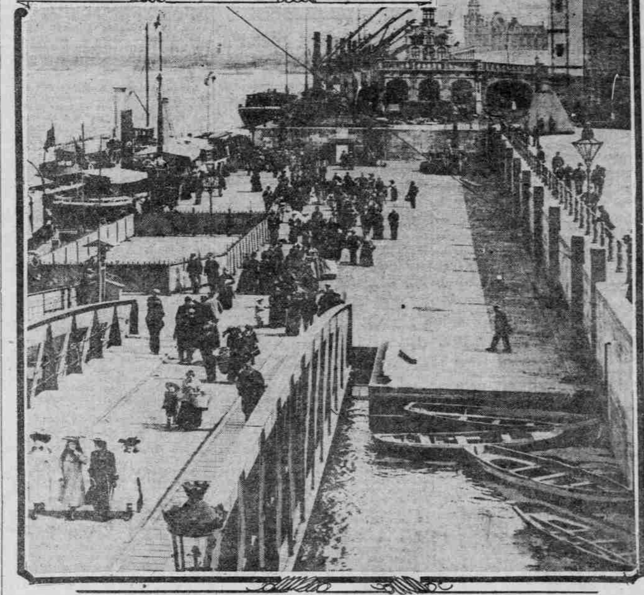
Photograph of scene on Antwerp's waterfront. On the map is shown Ostend, on coast west of Antwerp, to which the Seat of Government has been hastily removed. Germans are now in possession of all Belgium except Coast Ports and Antwerp, which is tottering.