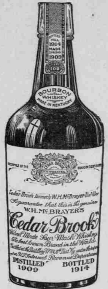
Bottled in Bond

You'll find CEDAR BROOK in the Lead at all Leading Clubs, Bars, Restaurants, Hotels and also at all Leading Dealers.