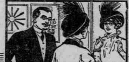
Fits U Eyeglasses

HAWTHORNE Parent-Teacher Circle will meet today at the schoolhouse at 2:30 o'clock. All the old members are