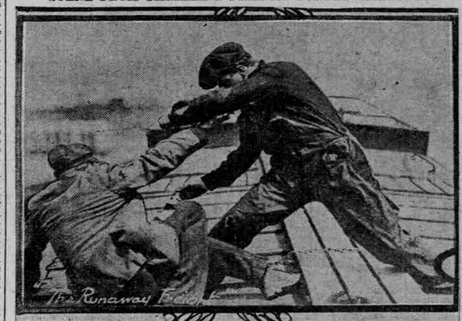
AN EPISODE IN "THE RUNAWAY FREIGHT."

SCENE FROM THRILLING FILM AT SUNSET THEATER.